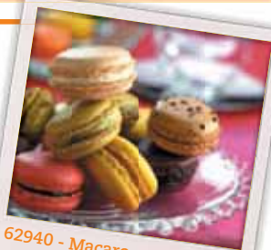
62940 - Macaroons de Paris