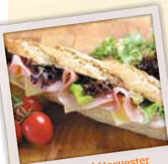
22340 - Baked Harvester Baguette 10"