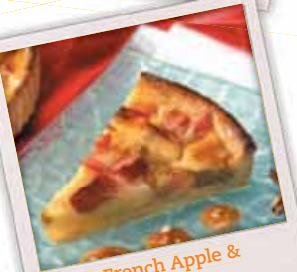
7807 - French Apple & Rhubarb Tart